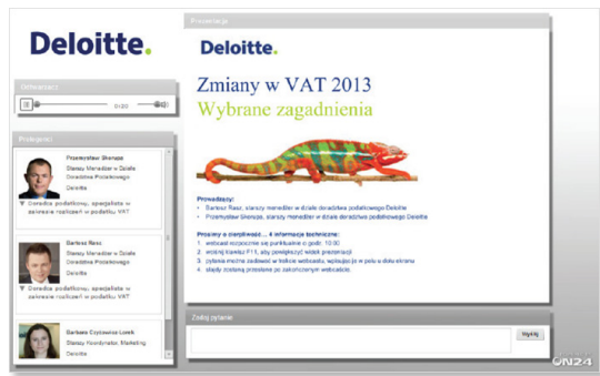
Deloitte Webinar: Zmiany w VAT

ON24 has successfully helped professional services companies lead the way in the growing online information marketplace for over a decade. With a substantial history of serving heavily regulated industries, ON24 understands what it takes to satisfy government regulatory, compliance, and customer-data confidentiality requirements.